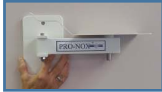
Pro-Nox Wall Mount