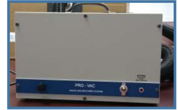
Pro-Vac Portable Scavenging System