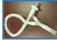
Patient Circuit with Mouthpiece