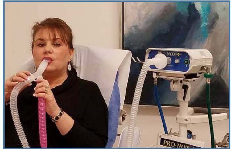
Patients using Pro-Nox in procedure rooms