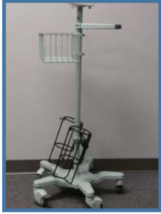
Pro-Nox E-Cylinder Mobile Cart