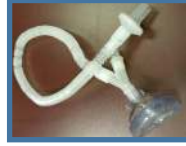
Patient Circuit with Mask