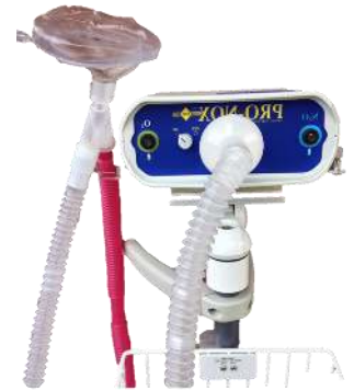
Pro-Nox Nitrous Oxide System

Studies have shown that it is non-addictive for the patient for procedures, while delaying or decreasing the need for other pain medicine. From Aesthetics, Dermatology, Plastic Surgery, Vascular, OBGYN, Orthopedics, Pain Management, Regenerative Medicine, Urology, Birth Centers, Hospitals, Surgery Centers and More ~ Pro-Nox is a great alternative for pain management.